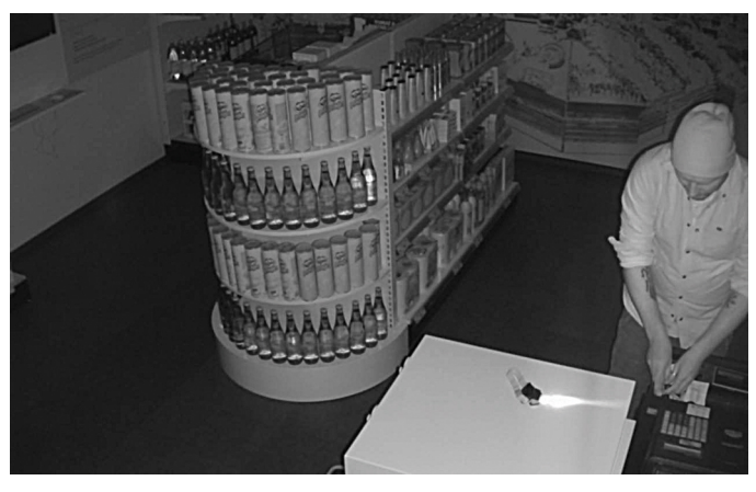
As light diminishes below a certain level, the cameras can automatically switch to night mode to deliver quality images in dark environments.

AXIS M11-L Series provides day and night varifocal bulti-in lens and adjustable IR LED illumination for optimal light in selected viewing angles. With Axis OptimizedIR, a power-efficient LED technology that provides an adaptable angle of IR illumination and discreet integration of IR LEDs, the cameras provide automatic illumination of a scene in complete darkness, at an event or when requested by a user. The IR LED illumination which is invisible to the human eye, is perfect for discovering objects in a range of up to 15 meters (50 ft)