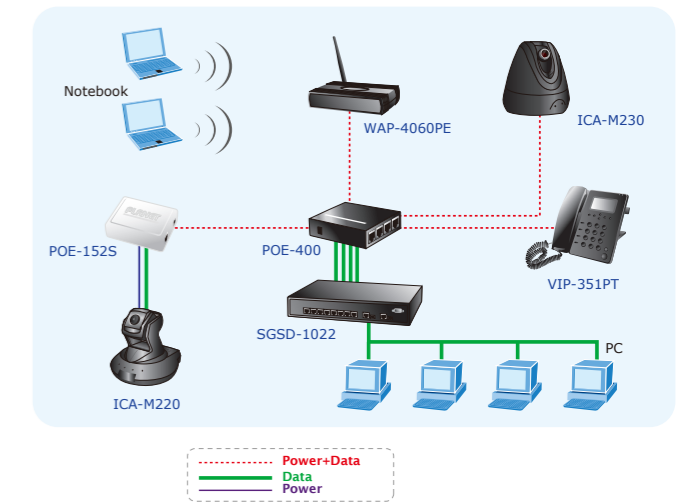
Figure 1: Connection architecture over POE-400

The 10Mbps or 100Mbps speed, duplex mode from Data port of POE-400 depends on which Ethernet device attached.