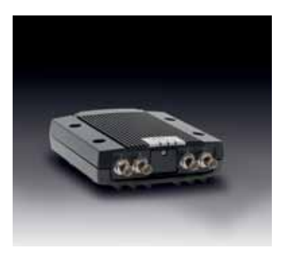
Product comparison tables Network video