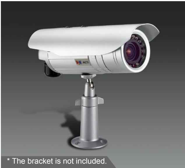
* The bracket is not included.