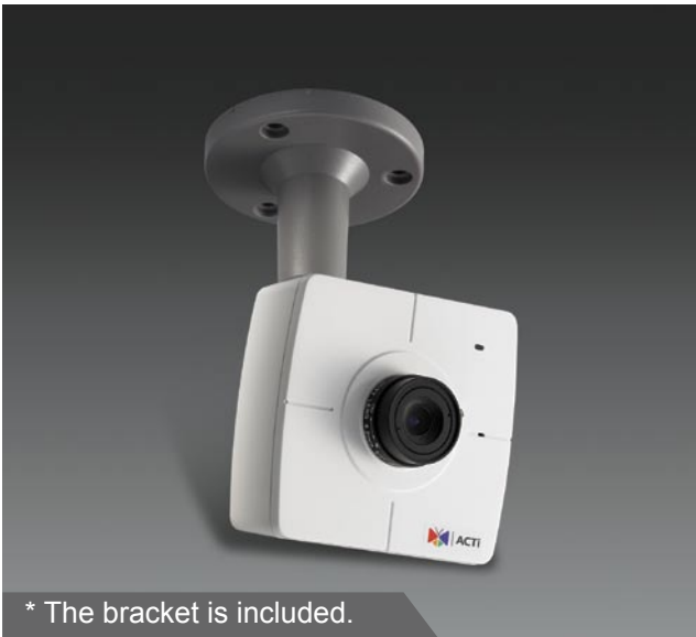
* The bracket is included.