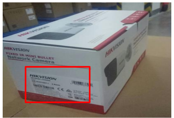
Figure 3 TOE box containing the TOE

The package contains a box with the TOE (see Figure 3). The user must verify that the information of the box is consistent to the HW and SW details provided by Hikvision.