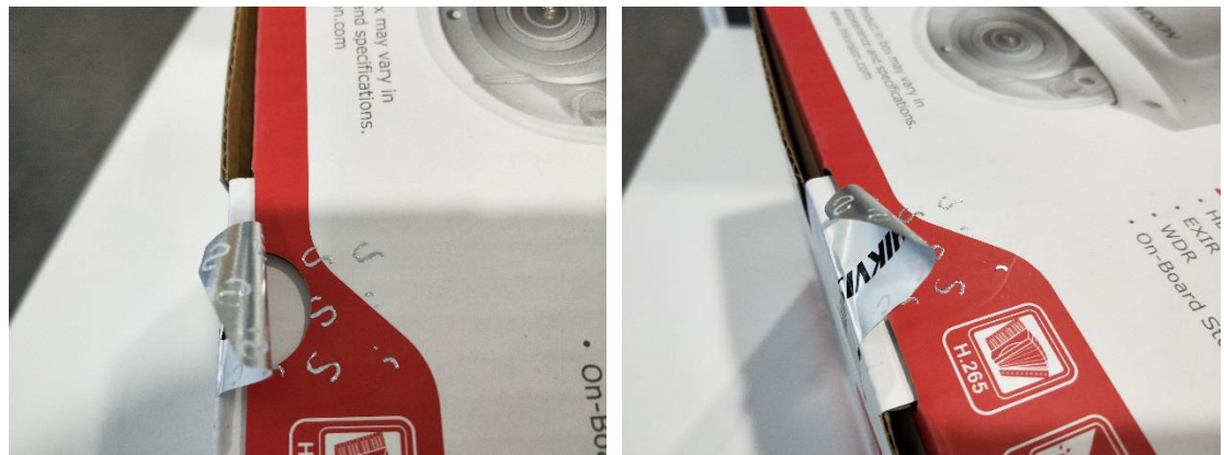
Figure 2 Tamper seal sample after a tampering attempt

The user must check that the tamper evident tape. If any irregularity is found, the user must not accept the package and must contact Hikvision in case of any issue happens during the delivery process to return the TOE. Hikvision will provide a replacement of the TOE.