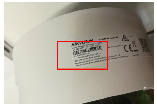
Figure 4 TOE label