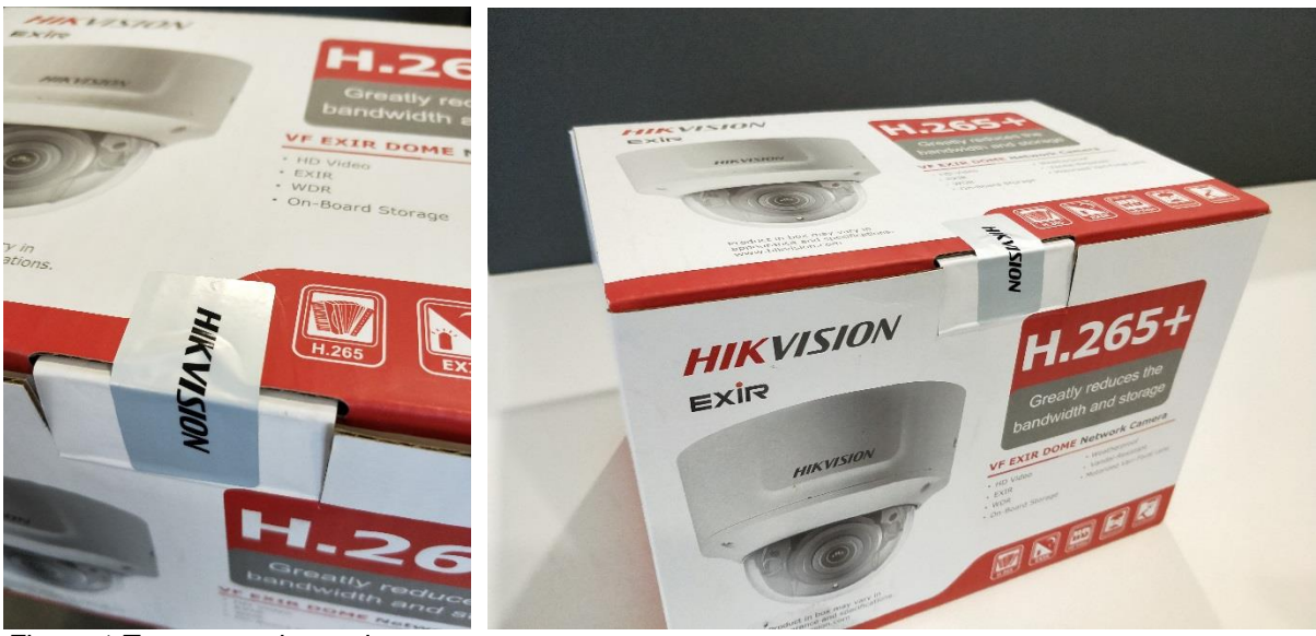
Figure 1 Tamper seal sample

The user must track the package and verify that the shipping details are coherent with the information provided by Hikvision once the package is received. If any inconsistency between the information sent by Hikvision and the actual delivery is detected, the user must not accept the package.