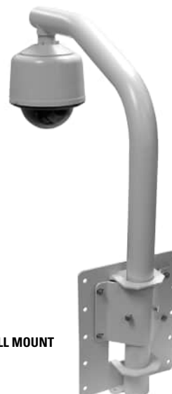
PP350 PARAPET WALL MOUNT

The PP350 and PP351 mounts were designed for outdoor use with small-size pendant domes (such as Spectra and DF5 Series), and the PP450 and PP451 are for outdoor use with medium-size pendant domes (such as DF8 Series). The PP350 and PP450 models mount to parapets, while the PP351 and PP451 models mount to rooftops or other smooth horizontal surfaces. All models accommodate domes that use 1.5-inch NPT pipe.