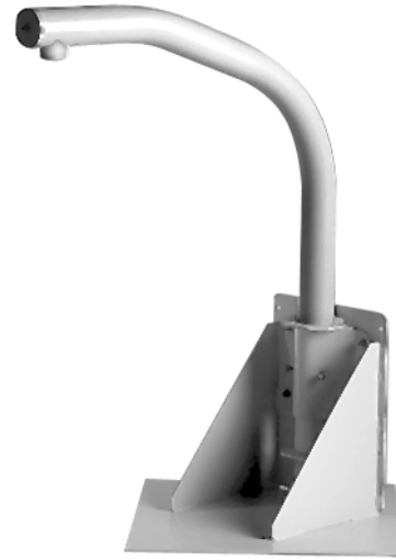
PP351 PARAPET ROOFTOP MOUNT