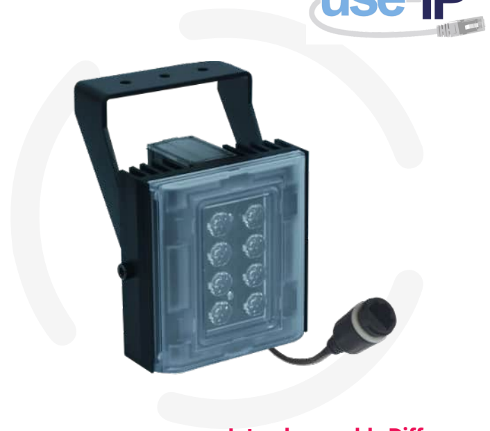
Interchangeable Diffuser Lens