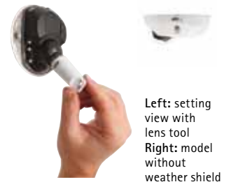
Left: setting view with lens tool Right: model without weather shield

The cameras provide a pixel counter for verifying that the pixel resolution of an object meets specific requirements. Power over Ethernet support further simplifies installation since only one cable is needed for carrying power and video.