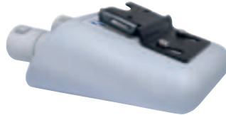
Rear Mounting Plate (removable for easy installation)