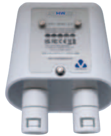
Cable Glands with Conduit Adaptors for Liquid Tight, Spiral & Plastic Corrugated Conduit