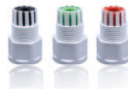
The XT package includes three different compressible glands (black, green and red as above), for different network and coax cable diameters, to ensure a tight seal.

HIGHWIRE Powerstar XT provides a true plug-and-play solution for connecting and powering external IP cameras over legacy coax cabling. Our design ensures reliable power and data links even over low-quality coax.