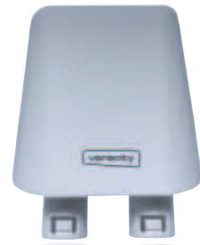
Front View Installed Orientation

The Base device provides POE power over the coax cable to the CXT device. The CXT is in a robust, sealed, external weatherproof housing (rated to IP66, IP67, IP69K and NEMA 4X & 6) and provides power and data connection to the IP camera (or other IP device) at the far end of the coax cable.