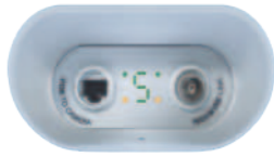
Hidden till lit 7 Segment LED Indicator Shows Power Level and Status