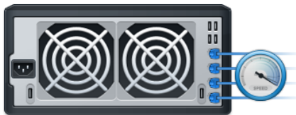
Figure 2) Superior Performance

Synology High Availability ensures seamless transition between clustered servers in the event of server failure with minimal impact to businesses.