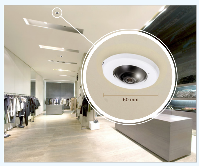
The Stylish Recessed-Mount Fisheye Network Camera