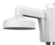
DS-1273ZJ-135B Wall mount with Junction box