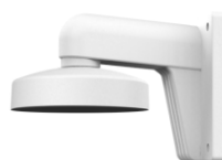
DS-1273ZJ-135 Wall mount