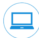
XProtect® Web Client