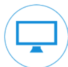
XProtect® Smart Client