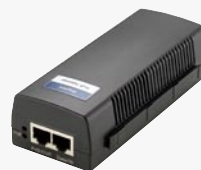
POI-2001 Gigabit PoE Injector