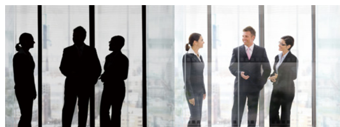
Without WDR Pro