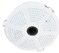
c26 with lens B016