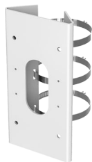
DS-1475ZJ-SUS Vertical Pole Mount