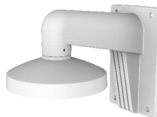
DS-1473ZJ-155 Wall Mount