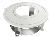
DS-DS-1227ZJ-DM42 In-Ceiling Mount