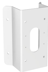
DS-1476ZJ-SUS Corner Mount