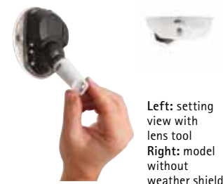
Left: setting view with lens tool Right: model without weather shield

The cameras provide a pixel counter for verifying that the pixel resolution of an object meets specific requirements. Power over Ethernet support further simplifies installation since only one cable is needed for carrying power and video.