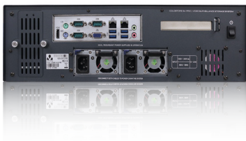
Rear view (above) showing dual Gig-E ports, alarm/relay connections and the dual hot-swap PSU option. Note that the two cooling fans are software controlled and are normally switched off.

Alternatively, third-party client applications can use Veracity's SDK or ONVIF Profile G to support the COLDSTORE NVR system directly.