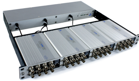
Rackmount | Four rack-mounted HIGHWIRE Powerstar Base 8 Linklock units assembled with a Veracity 1U PSU.