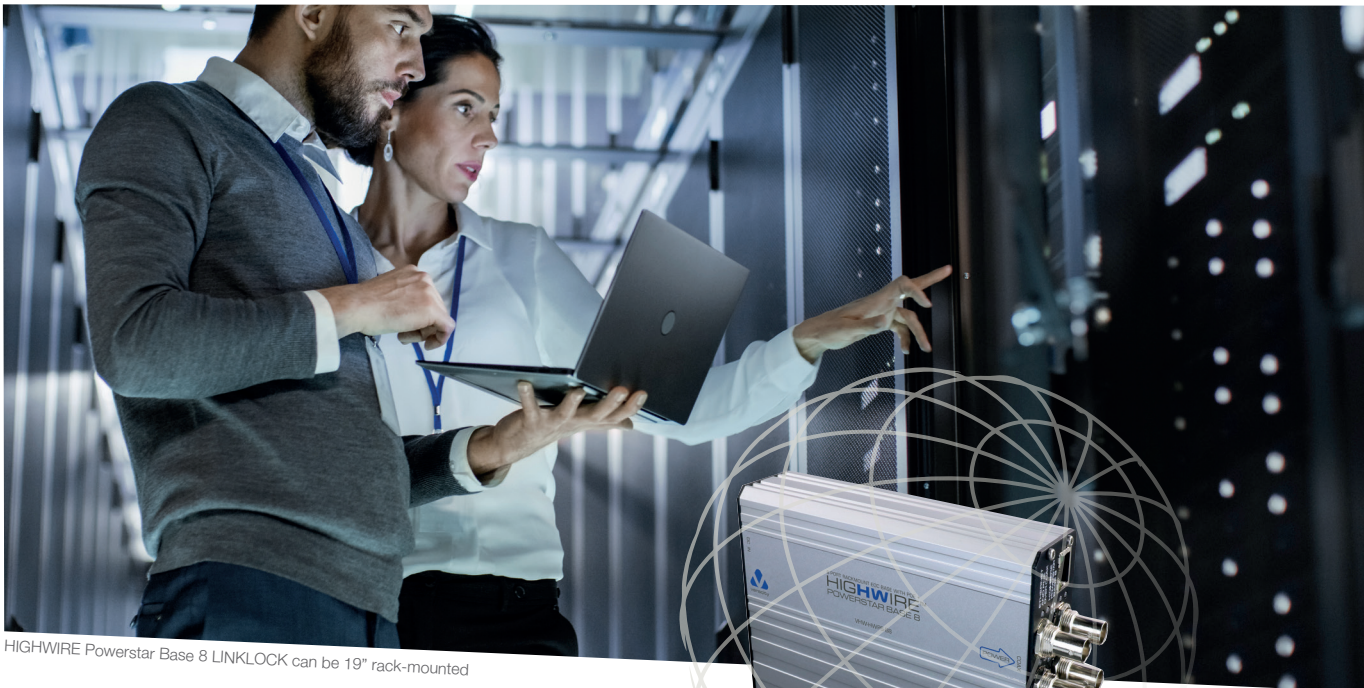
HIGHWIRE Powerstar Base 8 LINKLOCK can be 19" rack-mounted

LINKLOCK™ technology provides secure tamper-proof network connections over coax cable