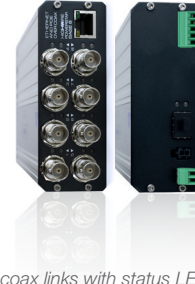
Front | 8 coax links with status LEDs, plus a Gigabit uplink port.