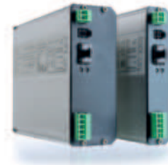
HIGHWIRE Powerstar Base 4 and 8 Linklock Rear | Power connectors (screw terminal or Micro-Fit) with SFP socket for fibre module and LINKLOCK Pins

Typically, the camera disconnection would be used to trigger an alarm within the VMS (Video Management System) or NVR (Network Video Recorder).