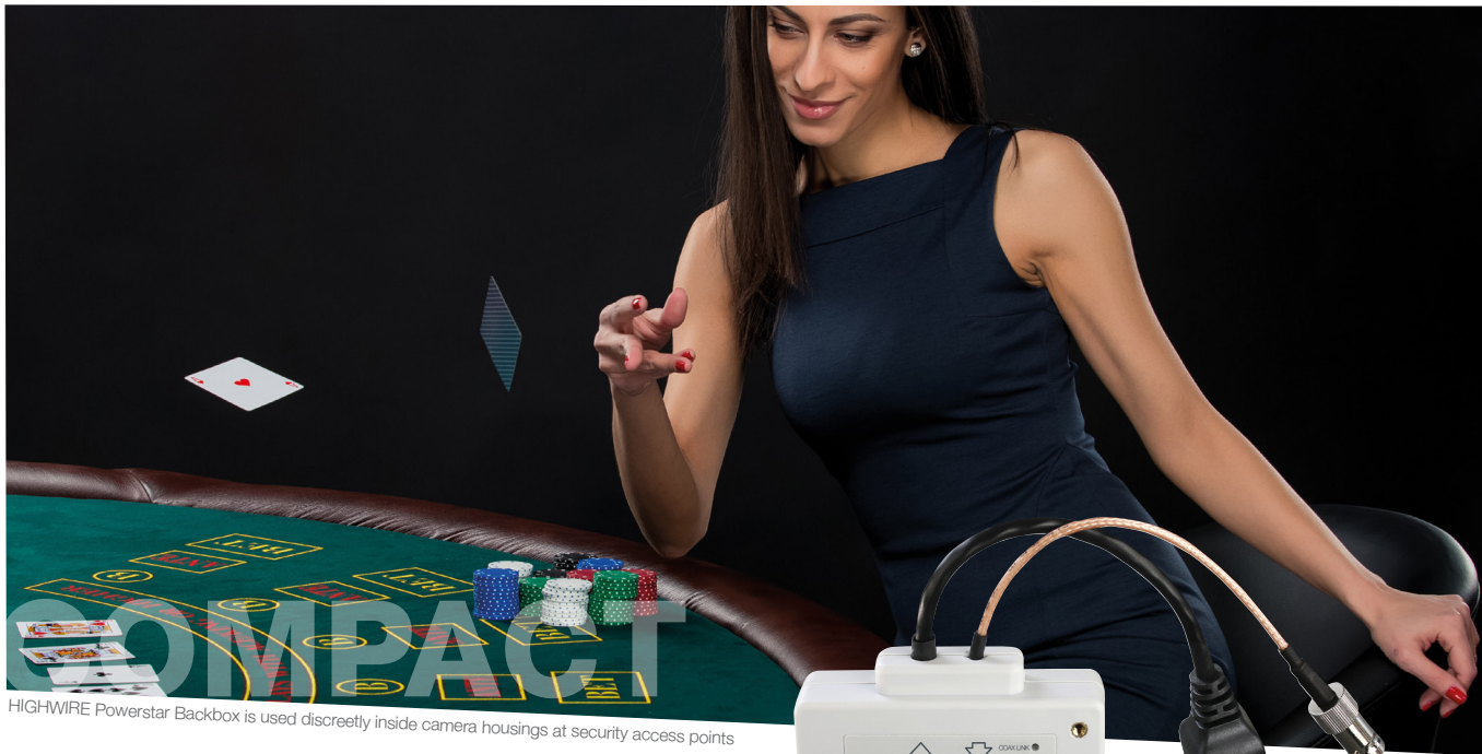
HIGHWIRE Powerstar Backbox is used discreetly inside camera housings at security access points